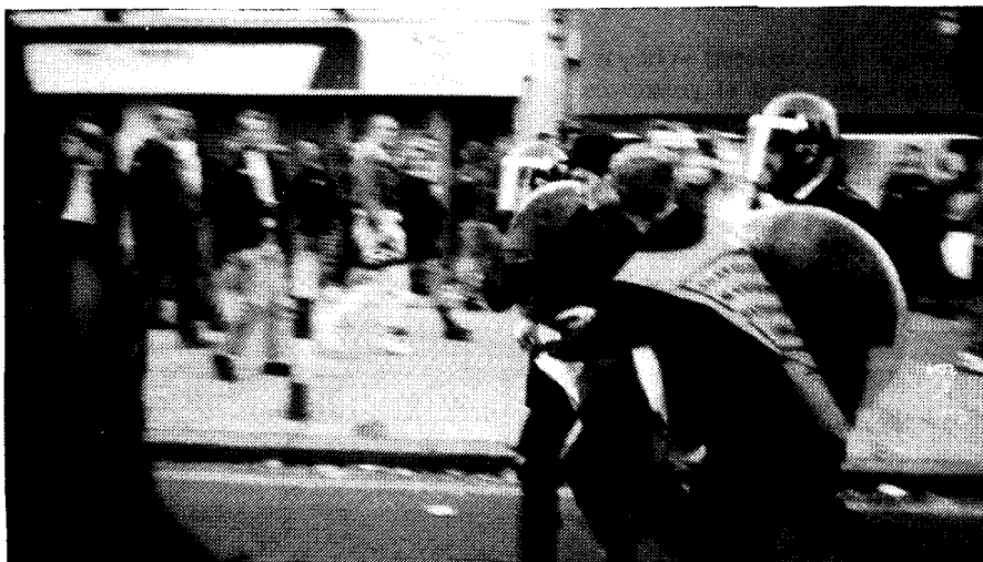
LLV (in TSDC pink bib) witnessing arrest