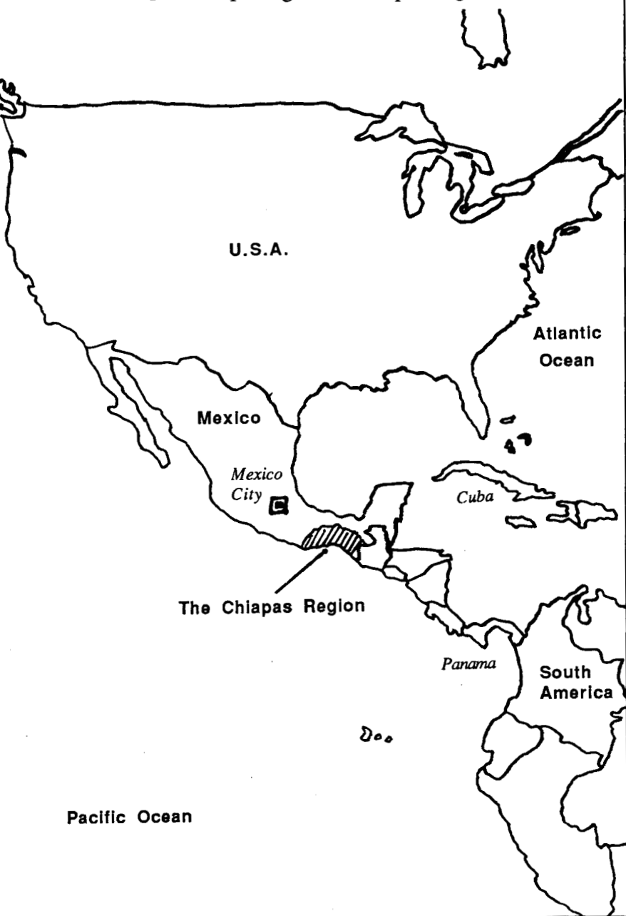
Map: The Zapatista Uprising & the Chiapas Region of Mexico